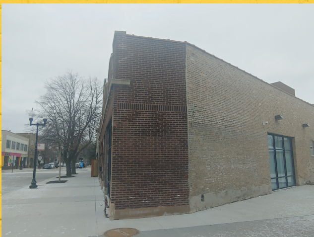
NORTHCENTER TOWN SQUARE C4 BUILDING 4100 N DAMEN AVE

As it is our programs first year, for 2022 we have two pre-selected and approved sites: