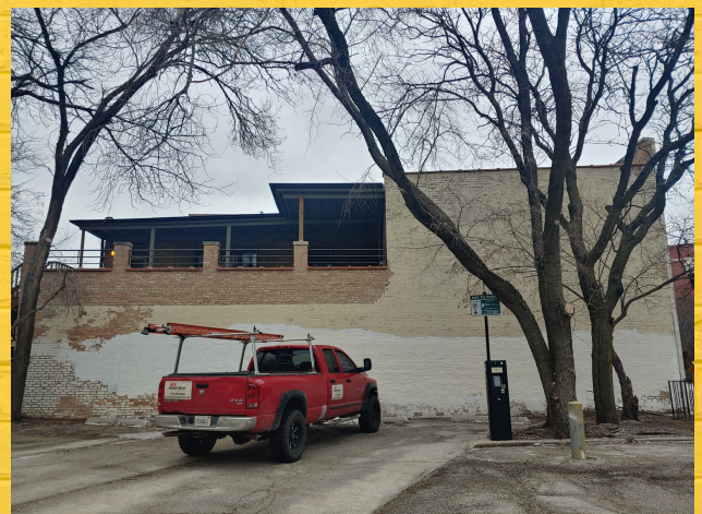
LOT 87 WALL ON NORTH SIDE 1914 W BERENICE AVE